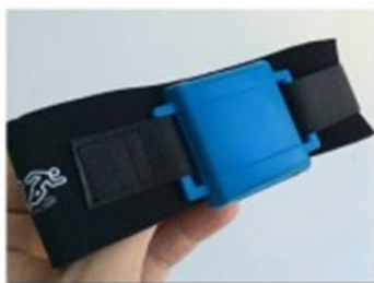
Reusable Timing Chip