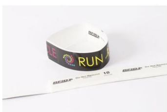
Disposable Timing Chip